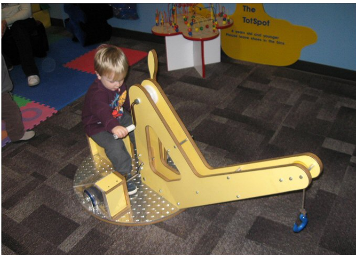
Eugene, OR Science Museum