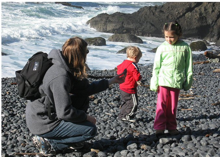
Yaquina Head Light House