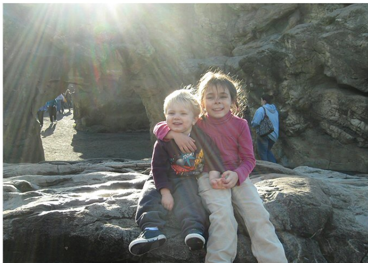
Oregon Coast Aquarium